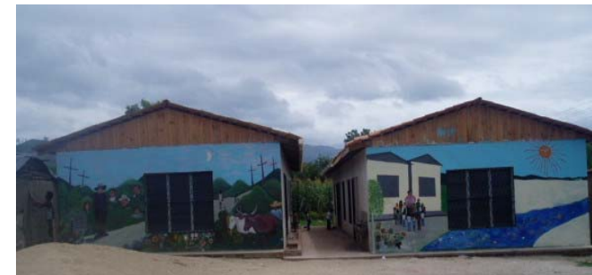
Center in Nueva Esperanza, 2006

AACC/PIEAT & ECE Students of Naropa University